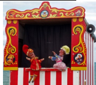
Punch and Judy